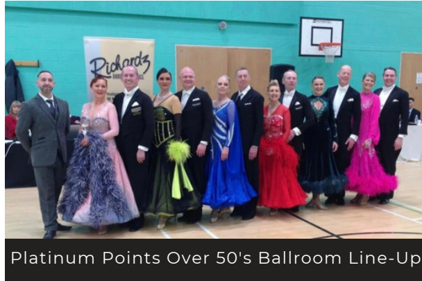
Platinum Points Over 50's Ballroom Line-Up